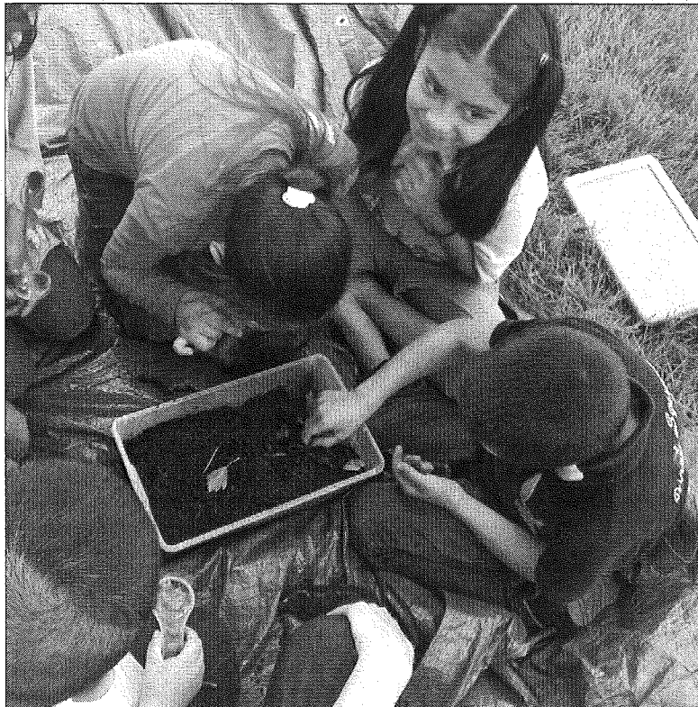
Students had the opportunity to examine a fallen log and containers of soil with magnifying glasses, to find any worms and insects that might be living there.

cycle of a tree—as it goes from acorn, to sapling, to mature tree, to aging tree, to a fallen log, and back into the earth, all the while being visited by so many visitors that depend on it. Students then moved outdoors where they acted out the story with students playing various parts—including the tree, wind, sun, rain, woodpeckers.